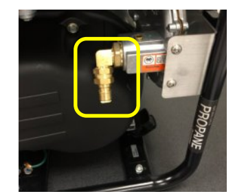
Propane & natural gas inlet location. Note protective cap removed for access

DO NOT connect your generator directly to a propane tank without the proper regulator or to an intermediate 10-15psi regulator often found on large tanks. Your generator comes pre-set from the factory to run from low pressure propane at 7-11" w.c. equivalent to approx. 1/2psi standard household pressure.