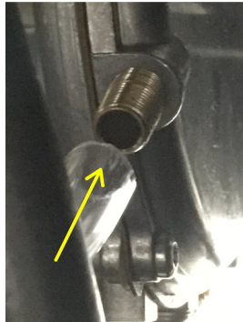
1b-3 pull off vent hoses from brass nipple of internal regulator suspended from inside of lid.