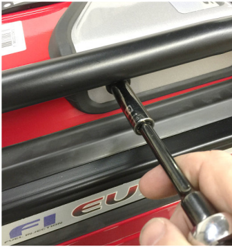
1a-1 Remove #10mm side bolt holding corner cover on

#2 Phillips head screwdriver #10mm box end wrench flat head screwdriver 10mm socket Safety goggles