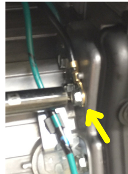
1b-4 Unfasten ground strap from internal regulator by removing existing #10mm ground bolt, and re-installing with just black ground wires under bolt head and tightening down.