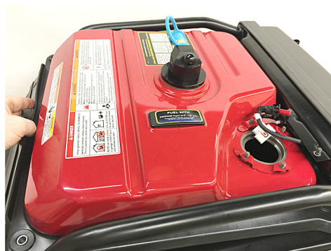
1c-2 Lift off entire red cover up from the back then slide out back. NOTE the orientation of the black large tank gasket then remove and place on gasoline tank in same orientation. Take your time with this - its important to get this gasket fully on.