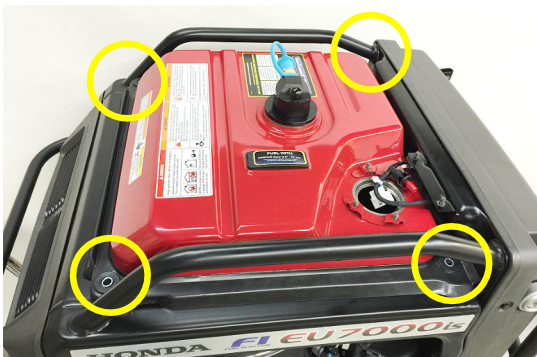
1c-1 Remove 4 corner #10 hex bolts.