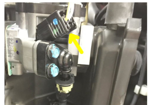
1d-3 Reconnect gasoline fuel injector electrical connector. This cable is folded in behind throttle body. Reinstall side door.