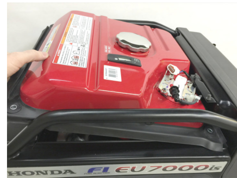
1c-3 Install gasoline tank at angle and push forward. Use a star screwdriver to help align 4 corner holes with frame. NOTE make sure gasket is completely installed or this step will fail.