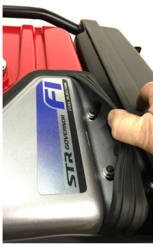
1a-2 /3 Pull back rubber gasket and remove 2 #10mm nuts then pull up and remove corner cover.