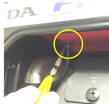
1d-2 Reconnect gas tank vent tube from underneath side of gas tank. DO NOT SKIP THIS STEP