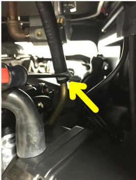
1b-1/2 Remove propane fuel tube clamp then separate propane fuel line from propane injector just above air box. Install supplied stopper into end of brass fuel injector twisting to make sure it seals hole in end.