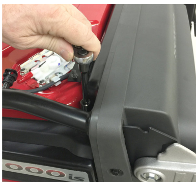
1d-1/2 Reconnect gas line and pump electrical connector after tightening down tank 4 #10 bolts. Note tank and quick disconnect gasoline hose may have red stoppers pushed on/in them to prevent spillage. Remove and discard if so.